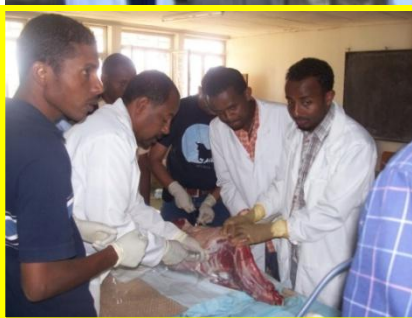
Top – a difficult breech delivery Middle – the trainees celebrate Bottom – chest drains and tracheostomy in a sheep carcass